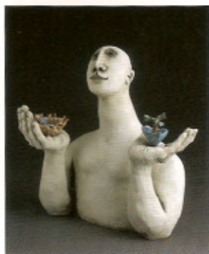
Nurture , 2005, handbuilt paperclay, stoneware, slips, stains, glaze, h.40cm, w.39cm, d.25cm